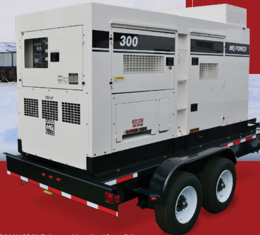
DCA300SSJU4F shown with optional PowerBalance

wheel bearings. And, as with our generators, we can customize our trailers with optional accessories to fit your specific needs.